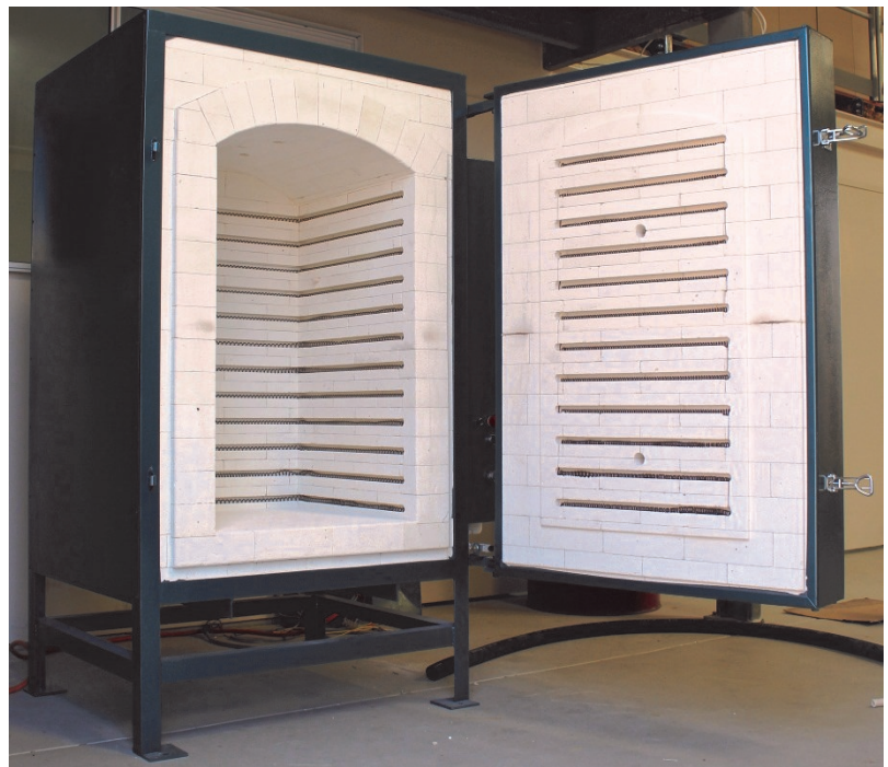
P120 (with arched roof option)